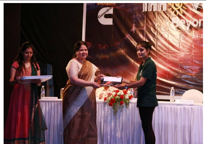
Prize Distribution for Innovation 2K17