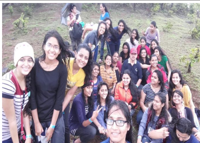
SE Class trip to Surya Shibir