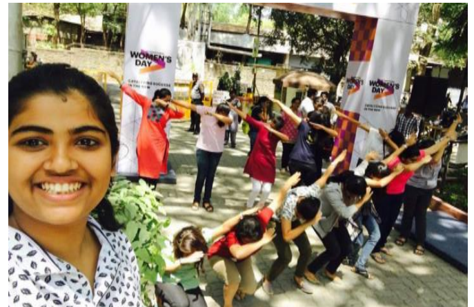
BE students at women's day