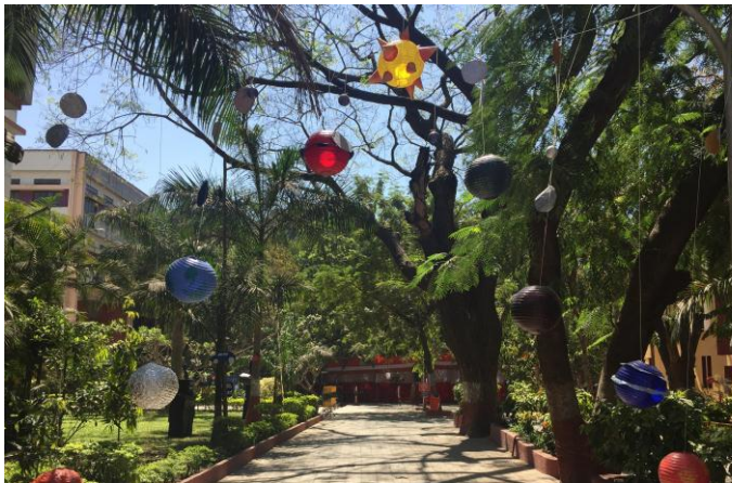
College Decoration during Innovation-2k17