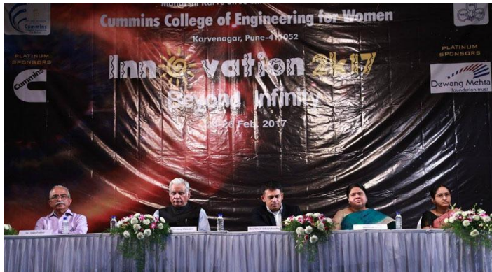
Instrumentation and Control Department hosting Innovation-2k17