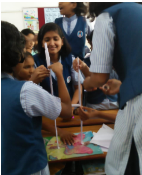
Science in everyday life – A STEM activity at Mahilashram School, MKSSS

In March 2016, the SWE CCEW affiliate was established. I was the Faculty Advisor right from the beginning. I completed my schooling in a small town, Gadhinglaj (Dist. Kolhapur). I was one of the first few girls to join engineering from the town. I had seen the struggles the girls faced to pursue education after 12th. Hence, when I got the opportunity to become the Faculty Advisor, I started nurturing my students and future engineers and working moms. SWE CCEW affiliate organized many programs such as Career Day, many technical and non-technical talks, STEM awareness events for the students. Our efforts were recognized by SWE, Chicago, USA. I was awarded the WE Local 2020 Engaged Advocate Award. The team is honored to accept this award. This award honors the individuals who have contributed to the advancement or acceptance of women in engineering. The individuals could be SWE Affiliate Advisors/Counselors/Entrepreneurs or STEM Professionals. A maximum of 12 awards may be presented annually at a global level. I was truly thrilled to have been recognized as one of the individuals who deserved this award. Hoping that this award will encourage more teachers and students to join the affiliate and contribute actively in the following years.