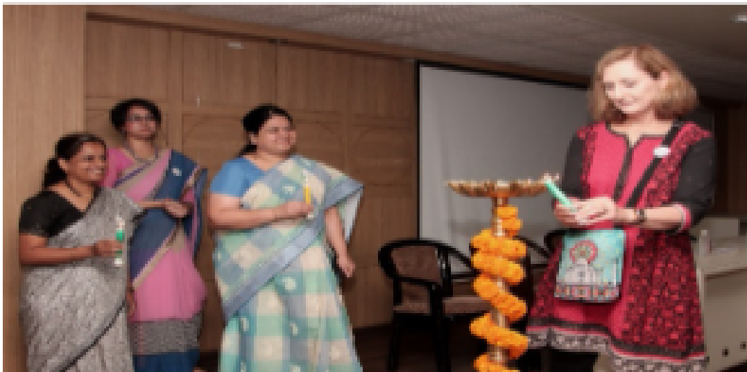
Inauguration of the affiliate

I was deputed to attend the Society of Women Engineers (SWE) India Symposium at Bangalore in August 2012 by the college. It was during this symposium; I got a chance to listen to great women leaders like Lila Poonawalla and Dr. Tessy Thomas. Thoroughly impressed with their experiences, I realized even such great ladies had struggles in their lives. I understood that it was challenging for them as well to maintain a work-life balance while pursuing their successful careers. I was educated on many day-to-day aspects of a working woman. I decided to spread awareness of common day-to-day problems among working women, especially working mothers. I also decided that it is very important to motivate mothers not to give up their jobs.