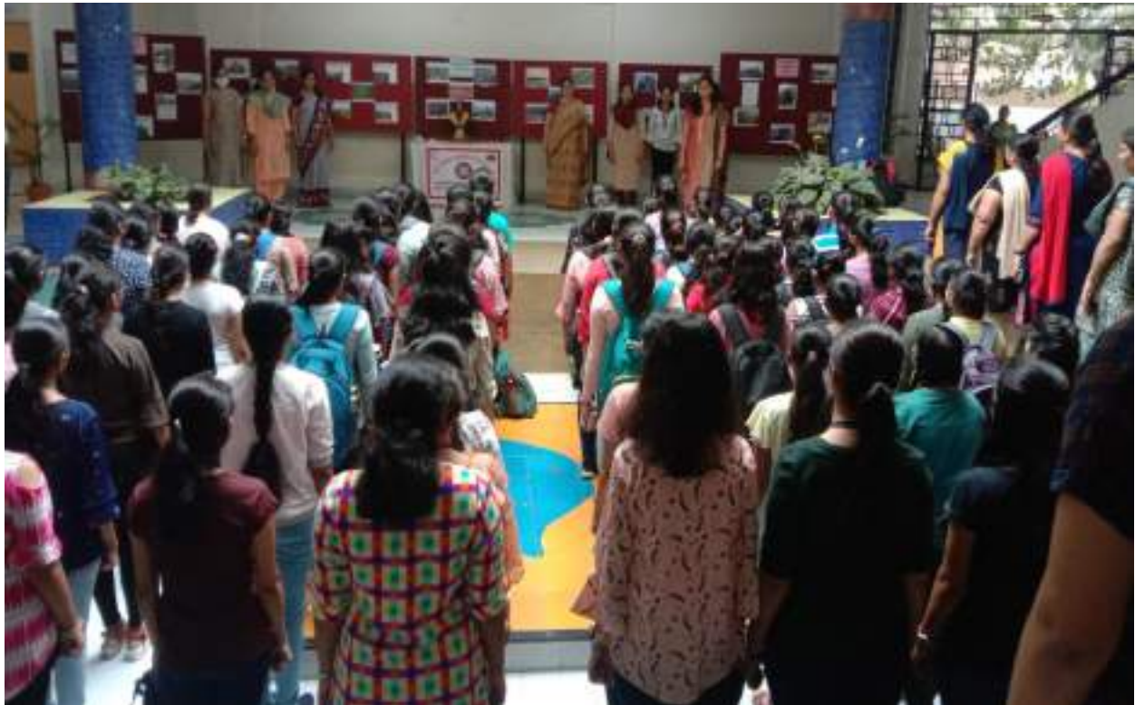
National anthem and Maharashtra Geet