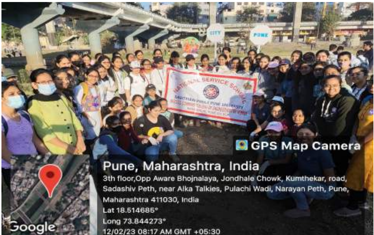
MKSS's Cummins College of Engineering students at My river My Valentine for Mula-Mutha River Bank Cleaning Drive