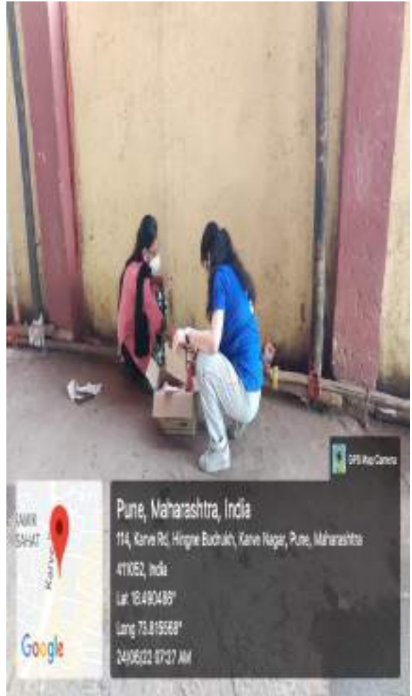
Cummins NSS Team cleaned the Bhairavnath mandir, Karvenagar where Warkari Dindya had come.