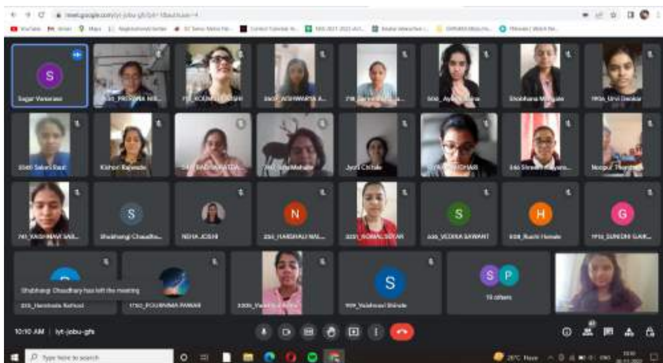
Constitution Day 2022 Celebration by MKSSS'S Cummins College of Engineering, Pune