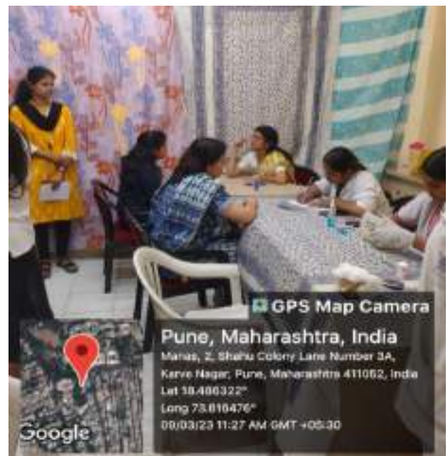
Faculty and students at Health check-up camp in MKSSSS'S Cummins College, Pune