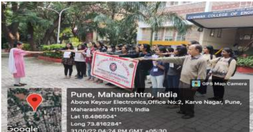
MKSSS'S Cummins College, Pune celebrated National Unity Day 2022 by taking pledge