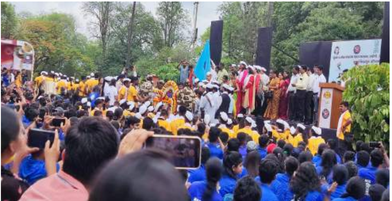
Cummins NSS Team joined the NSS Vari program at Pune University on 23 rd June 2022