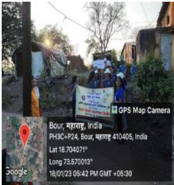
Voting Awareness Rally