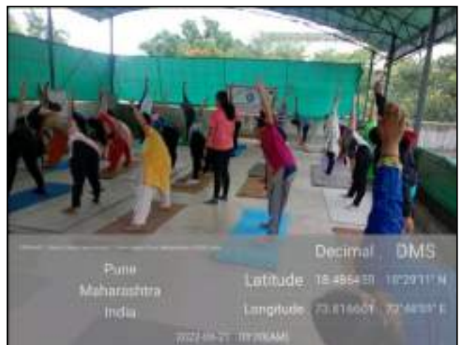
International Yoga Day 2022-23 Photos