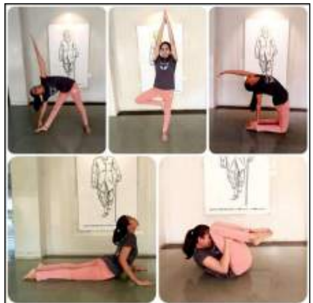
Yoga Poses Challenge Photos