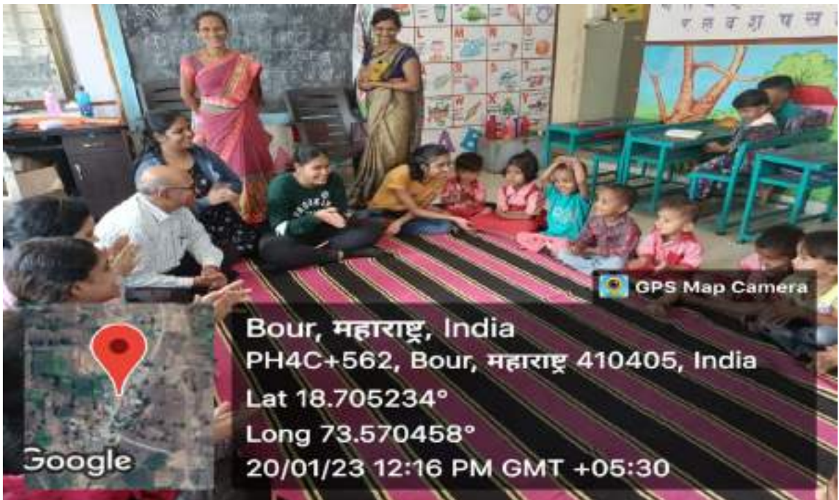
Fun activity for Anganwadi school Children