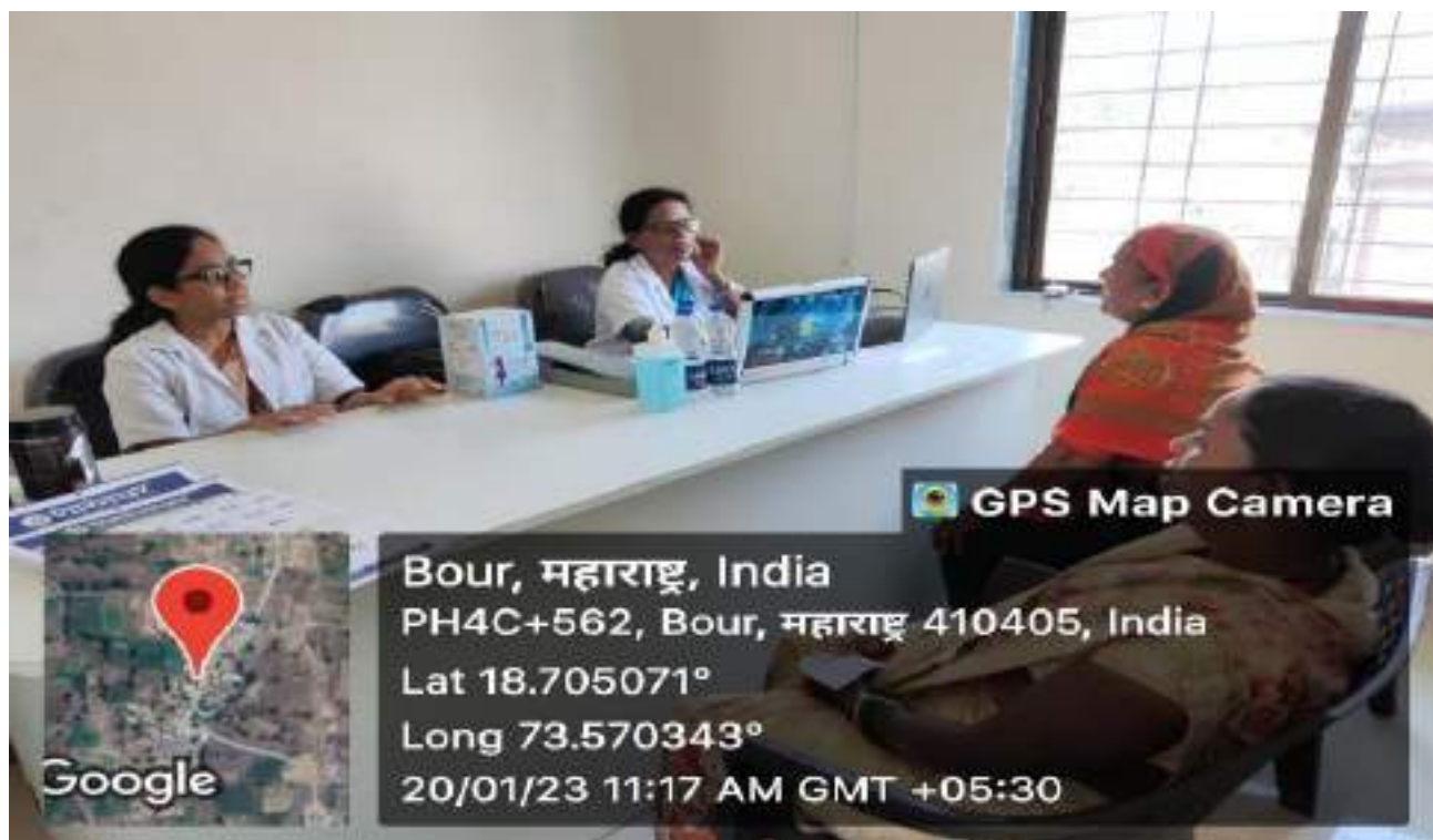
Health Check-up Camp