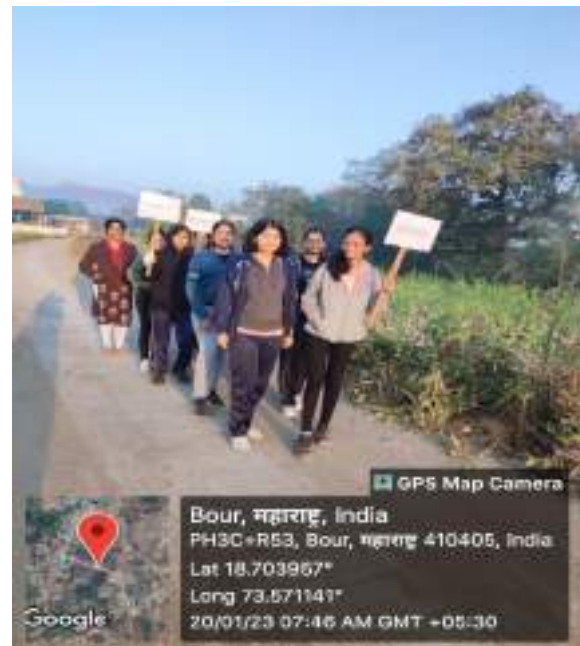
Bal Vivah Nirnuln Awareness Rally