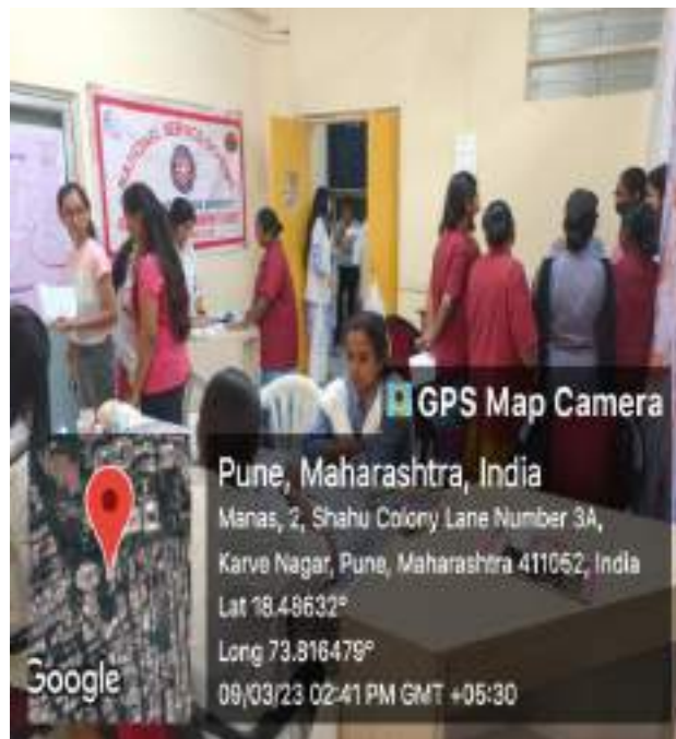
Guard and sweepers staff at Health Checkup

“International Women’s Day” celebration gives us the platform to help women empowerment and create awareness on various hygiene practices and prevention from Cancer and how to be healthy. Our NSS volunteers helped to organize this event. They learned many things like coordination, team building, event management and how to keep healthy.