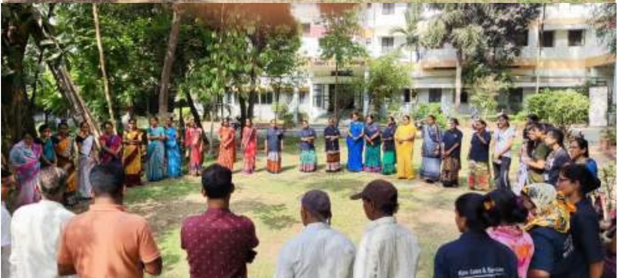
MKSSSS’s Cummins college of Engineering for Women celebrated World Environmental Day on 5 th June 2022