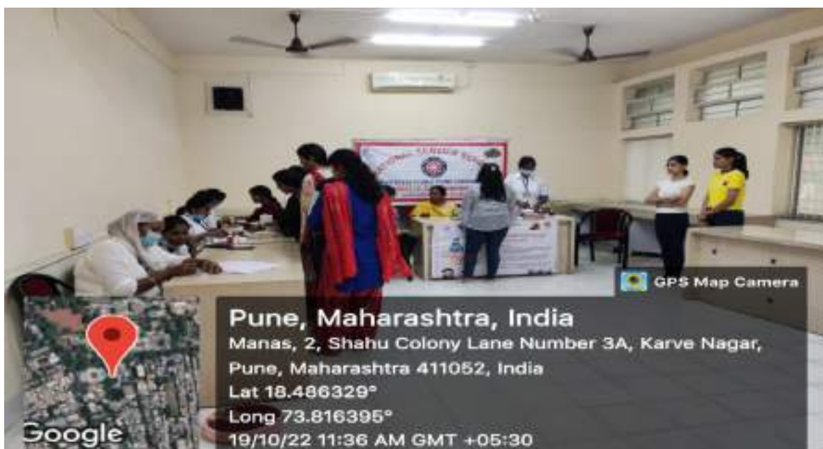
staff and students at Health check-up camp in MKSSS'S Cummins College, Pune