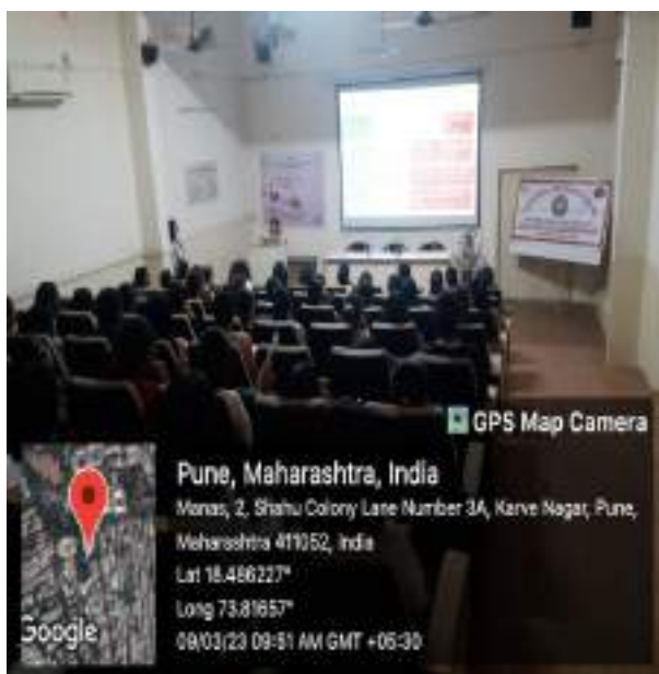
Photo Captured During the Session

Participating women got aware of various hygiene practices and prevention from Cancer and how to be healthy.