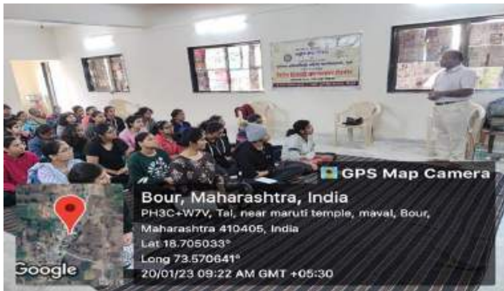
Meditation session by Sahajyog Dhyaan Kendra