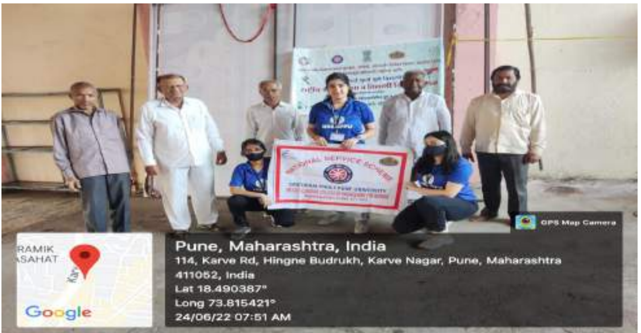
Cummins NSS Team along with Local people at Bhairavnath mandir, Karvenagar