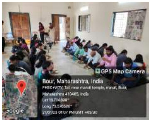
Lunch at Camp