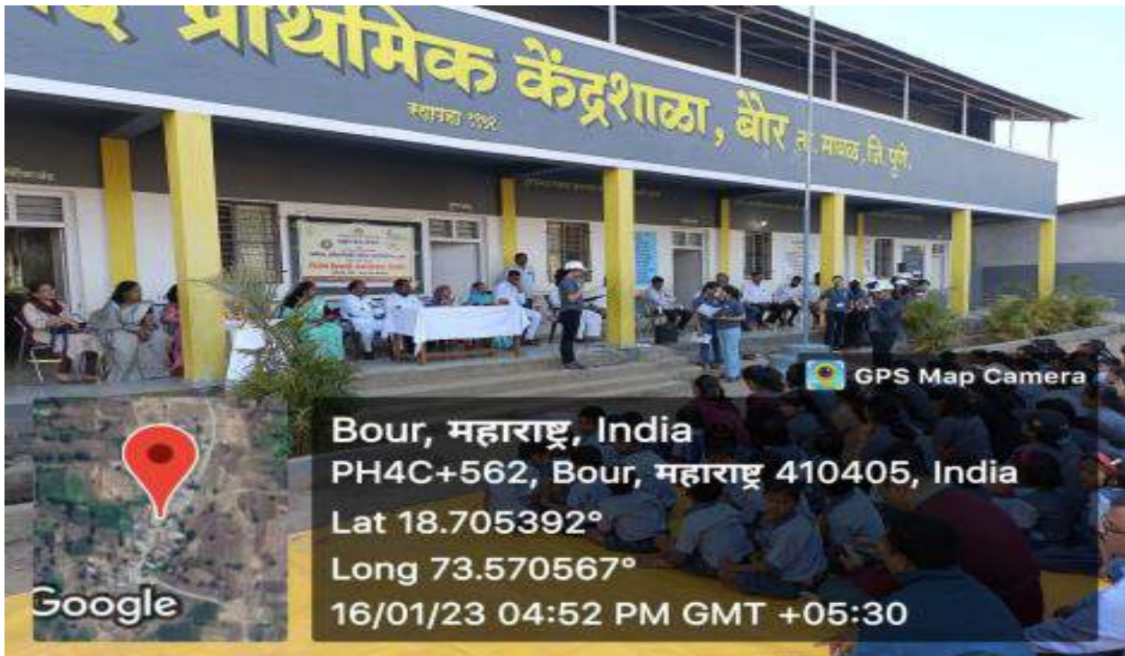
Inauguration of NSS Camp of MKSSS's Cummins College of Engineering for women, Pune