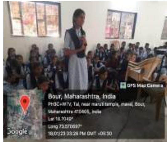
Importance of a Healthy and Balanced Diet