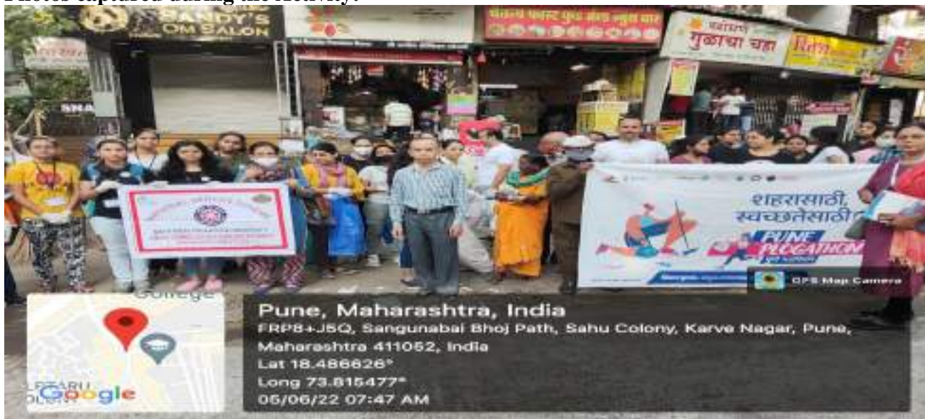
Cummins NSS Team participated in Plogathon-2022 Mega Drive