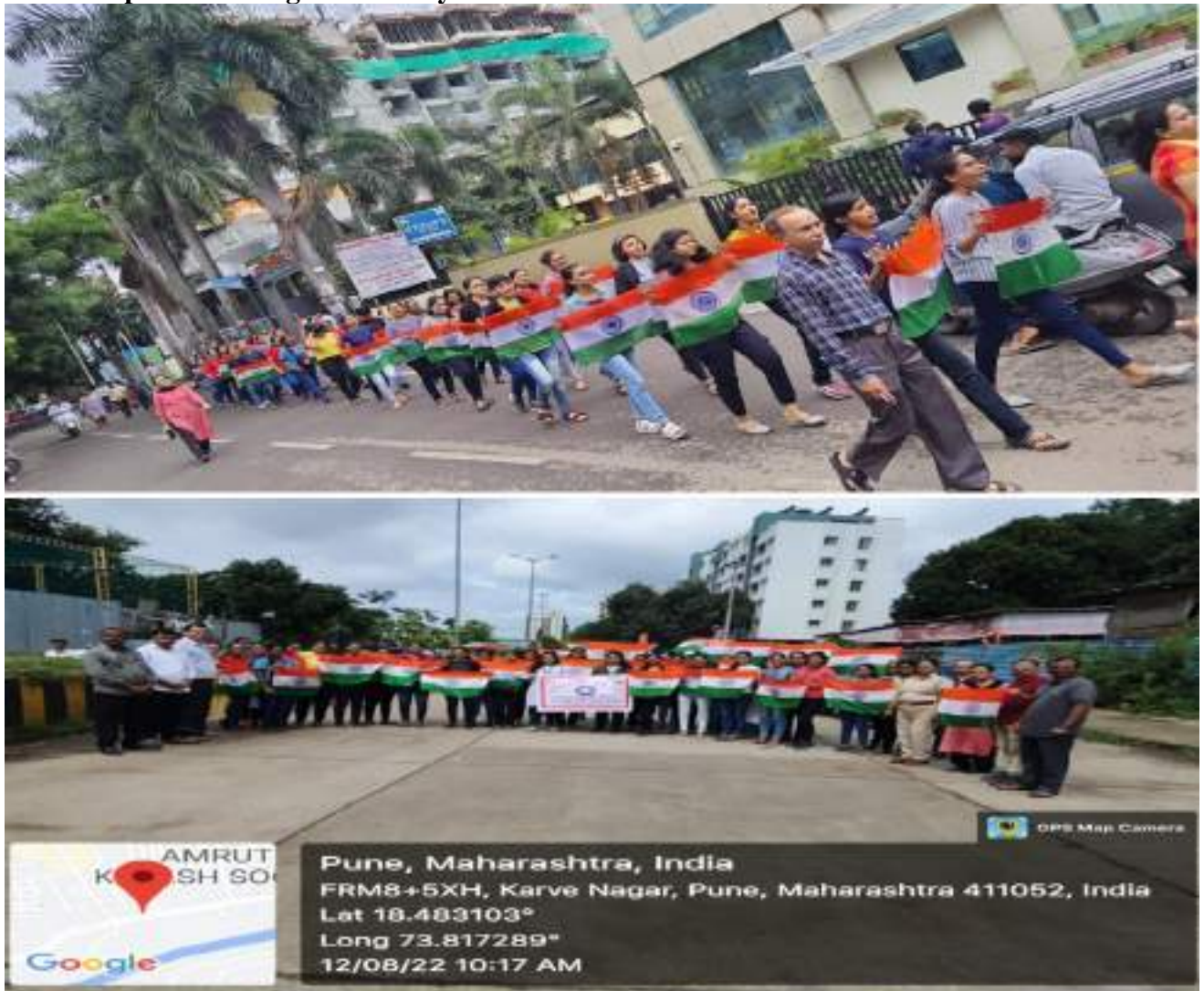
Har Ghar Tiranga Rally from Cummins college and Karvenagar area on date 12/08/2022