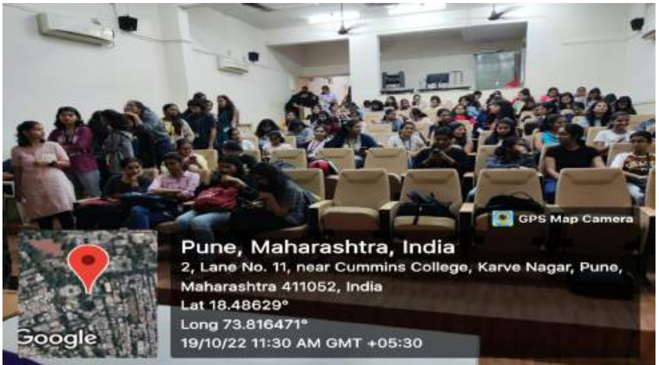
staff and students doing registration at Health check-up camp in MKSSS'S Cummins College, Pune