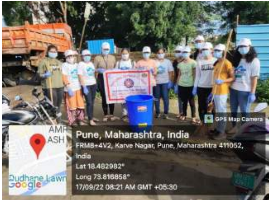
NSS Team of MKSSSS'S Cummins College, Pune during Swachh Amrit Mahotsav