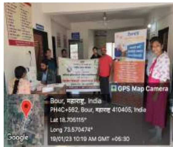
Eye Check-up Camp