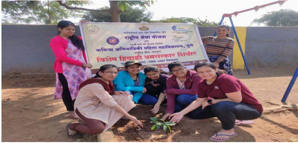
Tree Plantation Activity at Zilla Parishad School, Baur