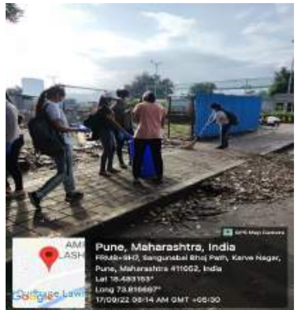
NSS Team of MKSSSS'S Cummins College, Pune doing road cleaning during Swachh Amrit Mahotsav 2022