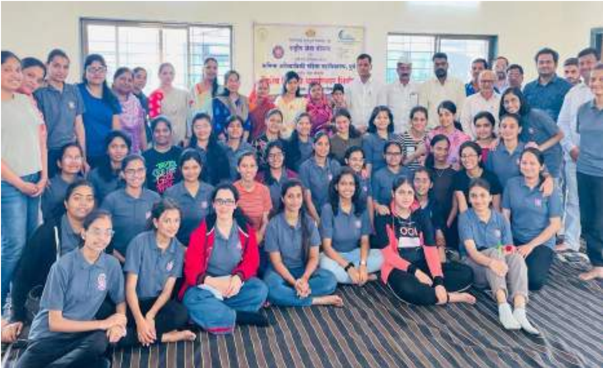
Team of NSS Winter Camp with villagers and gram panchayat members of Baur village