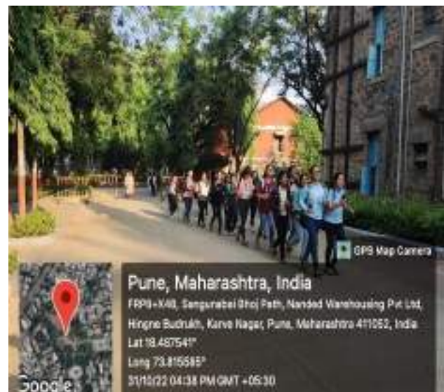
Run for Unity on occasion of National Unity Day 2022 by Cummins College, Pune