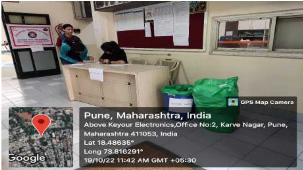
Plastic Collection Drive by MKSSSS'S Cummins College of Engineering, Pune