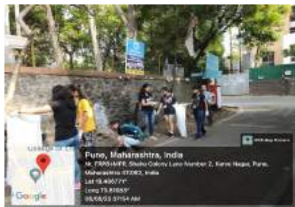
Cummins NSS Team collecting garbage during Plogathon-2022 Mega Drive