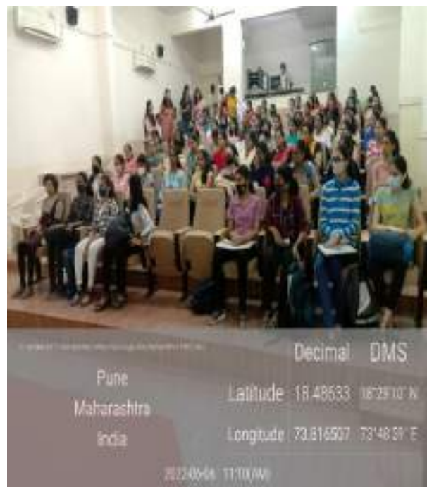
Exhibition and Lecture on forts in Maharashtra

Decimal DMS Pune Latitude 18.48533 18°29'10" N Maharashtra Longitude 73.816507 73°48'59" E India 2023-08-04 11:00(AM)