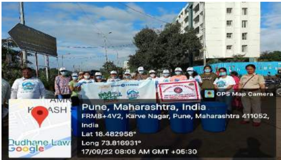
NSS Team of MKSSS'S Cummins College, Pune alongwith Pune Municipal Corporation in Swachh Amrit Mahotsav 2022