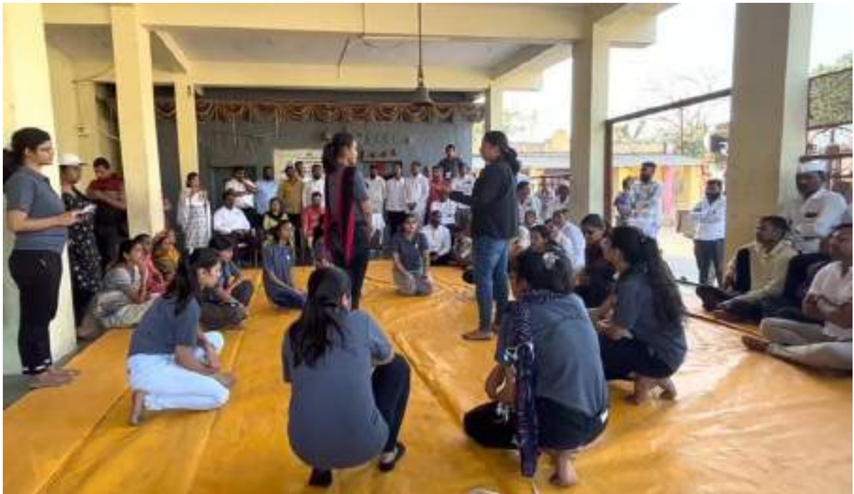
Street play on women's education and abolition of child-marriage by NSS volunteers