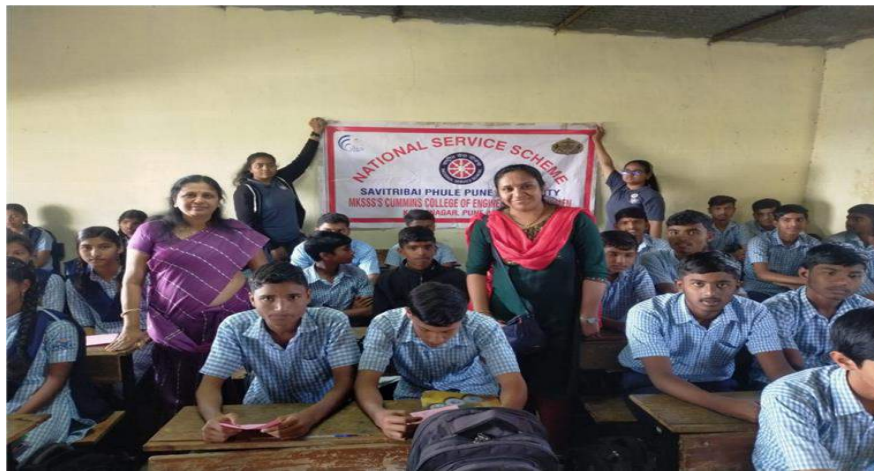
Mathematics Class for School students