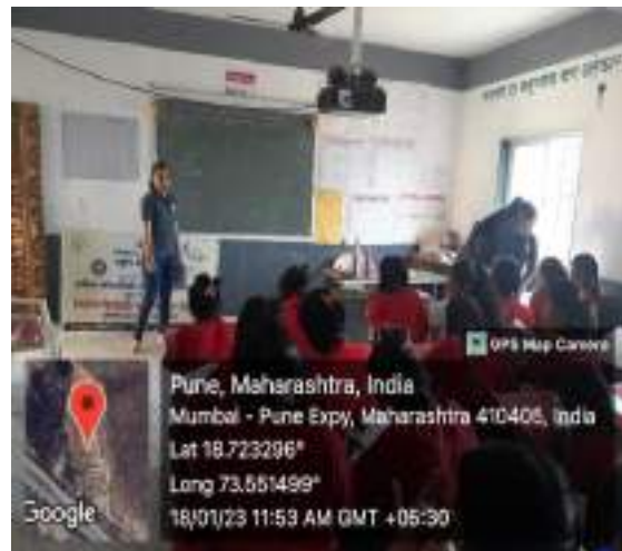
NSS volunteers taking study activity for school students 1 st to 7 th standard